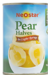
Pear Halves, 15 oz. Count: 1