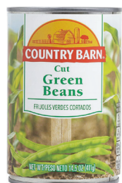
Green Beans, 14 oz. Count: 1