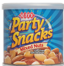
Mixed Nuts, 5 oz. Count: 1