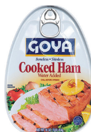
Ham, Cooked, 16 oz. Count: 1