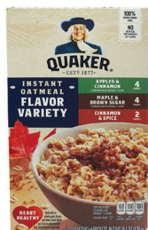
Oatmeal, Instant Packets Count: 10