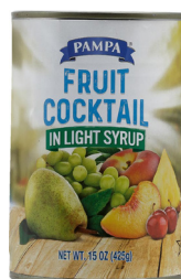
Fruit Cocktail, 14.5 oz. Count: 1