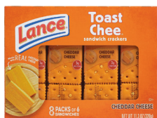
Sandwich Crackers, Cheddar Count: 8 pack