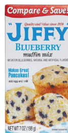
Muffin Mix, Blueberry, 7 oz. Count: 1