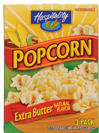
Microwave Popcorn Count: 3