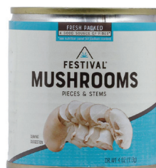
Mushrooms, 4.5 oz. Count: 1