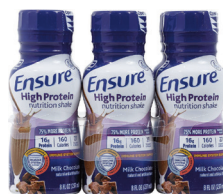
Ensure® Chocolate Shake, 8 oz. Count: 6