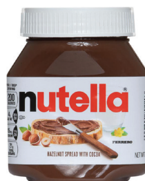
Nutella®, 7 oz. Count: 1