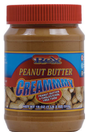
Peanut Butter, Creamy, 16 oz. Count: 1