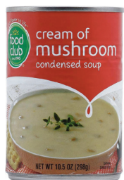
Cream of Mushroom Soup, 10 oz. Count: 1