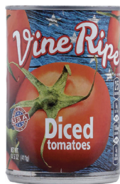
Tomatoes, Diced, 14.5 oz. Count: 1