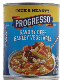
Steak & Vegetable Soup, 18.8 oz. Count: 1