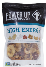
Fruit & Nut Mix, 6 oz. Count: 1