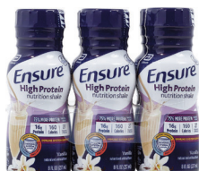
Ensure® Vanilla Shake, 8 oz. Count: 6