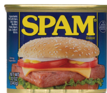
Spam®, 12 oz. Count: 1