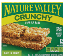
Nature Valley™ Granola Bars Count: 12