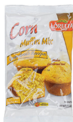
Muffin Mix, Corn, 8 oz. Count: 1