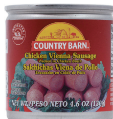
Vienna Sausage, 4.6 oz. Count: 1