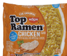
Ramen Noodle Soup, 3 oz. Count: 1