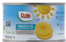
Pineapple, Sliced, 8 oz. Count: 1