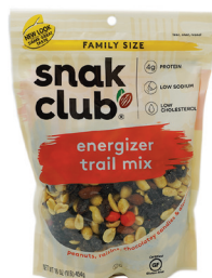
Trail Mix, 16 oz. Count: 1