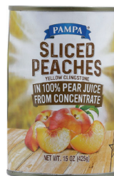
Peaches, Sliced, 8.5 oz. Count: 1