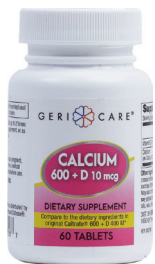
Calcium + Vitamin D3 Tablets, 600 mg.‡ Count: 60 ct.