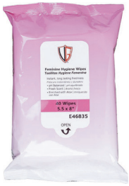
Feminine Hygiene Wipes Count: 40 ct.