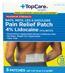
Lidocaine Patch, 4% Count: 5 ct.