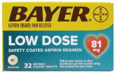
Bayer® Enteric Coated Aspirin, Low Dose, 81 mg. Count: 32 ct.