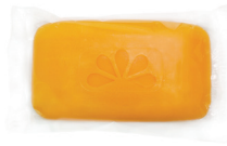
Anti-Bacterial Bar Soap Count: 1 ct.