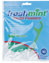
Interdental Flossers Count: 90 ct.