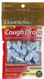
Cough Drops, Sugar-Free Count: 25 ct.