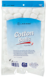
Cotton Balls Count: 100 ct.