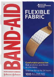
Band-Aids®* Count: 100 ct.