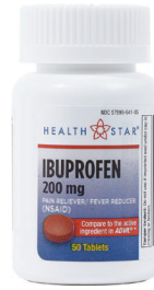
Ibuprofen Tablets, 200 mg. Count: 50 ct.