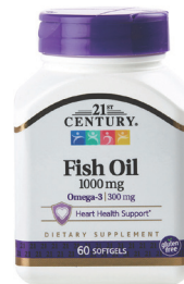
Fish Oil Softgels, 1,000 mg.‡ Count: 60 ct.