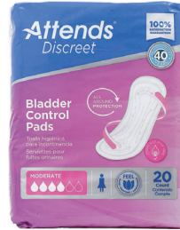
Attends® Discreet Women's Moderate Bladder Control Pad* Count: 20 ct.