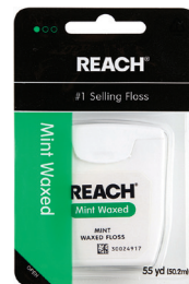
Dental Floss, Reach®, Mint Waxed Count: 1 ct.